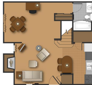
Penthouse Suite: bi-level loft, 850 sq. ft.