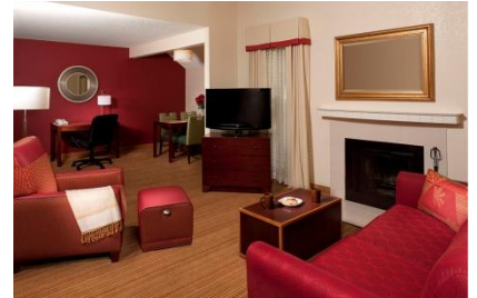
Sleeps up to 5 guests

Penthouse Executive Suites: These 1 bedroom + loft suites are 850 sq. ft. and feature: