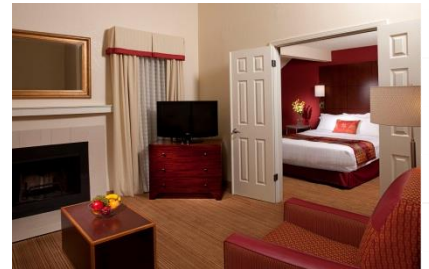
Sleeps up to 5 guests