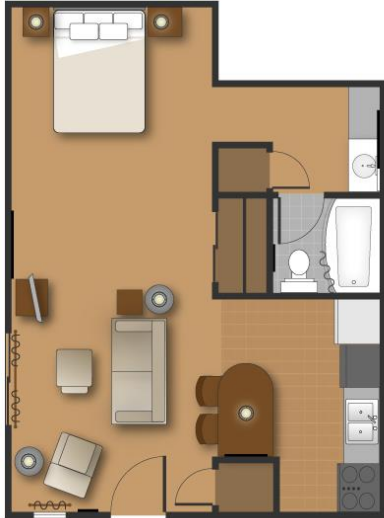
Studio Suite: 550 sq. ft.