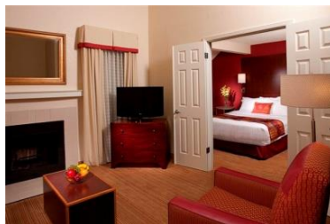
Penthouse Executive Suite