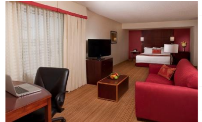
Sleeps up to 3 guests

Penthouse Suites: These bi-level suites are 850 sq. ft. and feature: