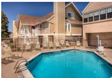
Outdoor Heated Pool