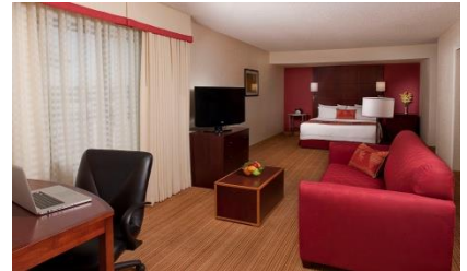
Sleeps up to 3 guests

Penthouse Suites: These bi-level suites are 850 sq. ft. and feature: