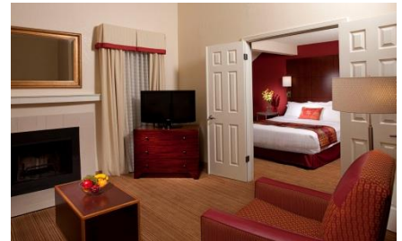
Sleeps up to 5 guests